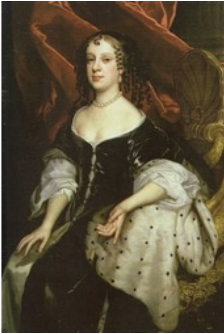
Catherine of Braganza